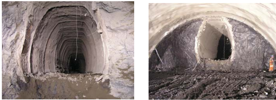
Fig. 2 The Komořany tunnel pilot adit

respectively. The adit also included approximately 30 m long sections where the profile was expanded to copy contour of the full tunnel top heading.