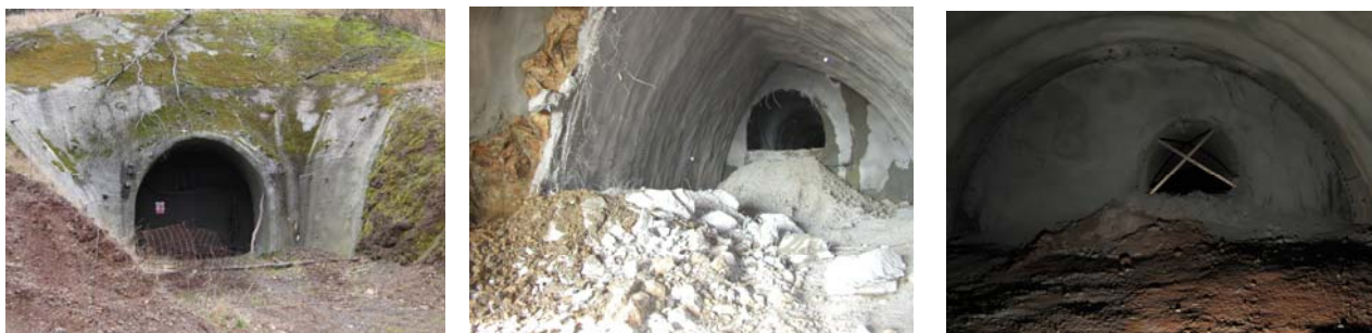
Fig. 3 The Prackovice tunnel pilot adit

tunnel were driven without problems; larger deformations of the southern (Prague) portal were solved by additional stabilisation measures.